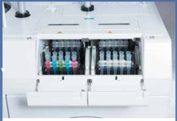
Record capacity up to 200 samples with continuous loading