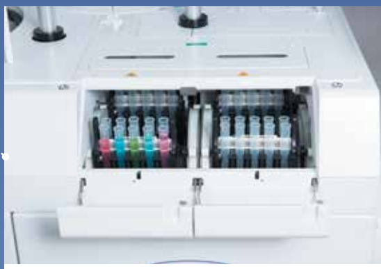
Record capacity up to 200 samples with continuous loading