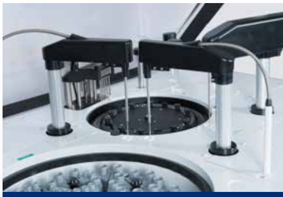
3 arms: 1 for samples, 2 for reagents