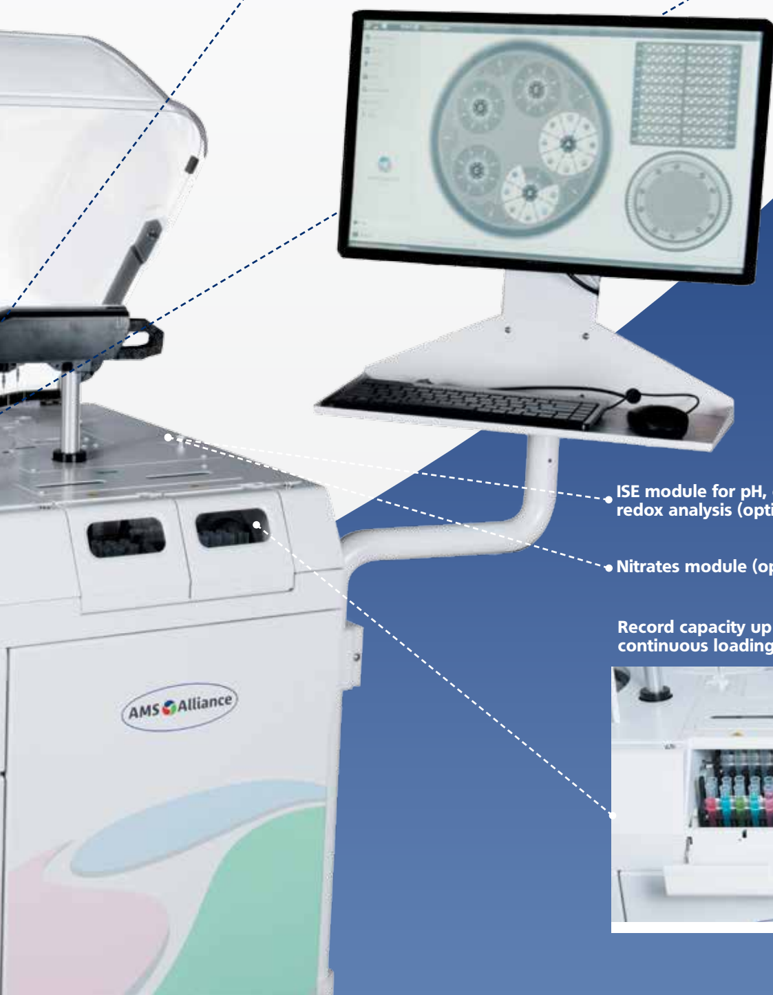
ISE module for pH, conductivity & redox analysis (option)